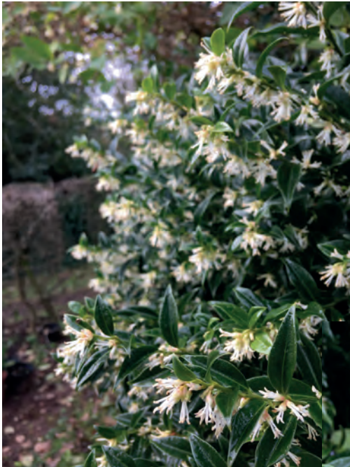
SWEET BOX, SARCOCOCCA CONFUSA